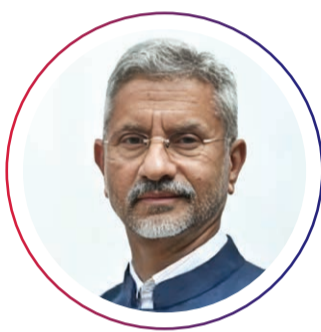
Dr. S. Jaishankar

Hon'ble External Affairs Minister Government of India