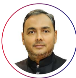
H.E Ahasanul Islam Titu Hon'ble State Minister of Commerce Government of Bangladesh