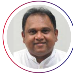
H.E Nalin Fernando Hon'ble Minister of Trade Commerce and Food Security Government of Sri Lanka