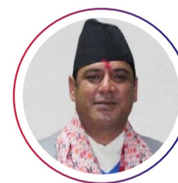
H E Damodar Bhandari Minister For Industry, Commerce and Supplies Government of Nepal