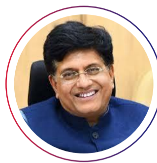
Shri Piyush Goyal

Hon'ble External Affairs Minister Government of India