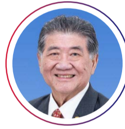
H.E Phumtham Wechayachai Hon'ble Deputy Prime Minister and Minister of Commerce Kingdom of Thailand*