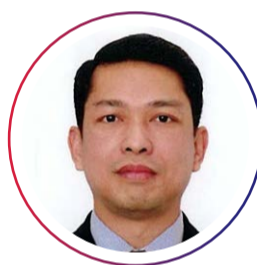
HE Minn Minn Deputy Minister Ministry of Commerce Government of Myanmar