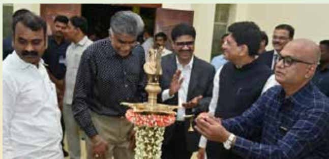
Shri Manoj Patodia, Chairman TEXPROCIL (extreme Right) lighting the traditional lamp along with Hon'ble Union Minister of Textiles, Commerce & Industry and Consumer Affairs, Food & Public Distribution, Shri Piyush Goyal and other dignitaries present at the inauguration of SIMA Texfair 2022.