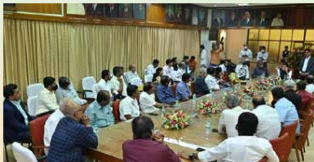
Hon'ble Union Minister of Textiles, Commerce & Industry and Consumer Affairs, Food & Public Distribution, Shri Piyush Goyal addressing the stakeholders at a consultation meeting held on the sidelines of the inauguration of SIMA Texfair 2022.