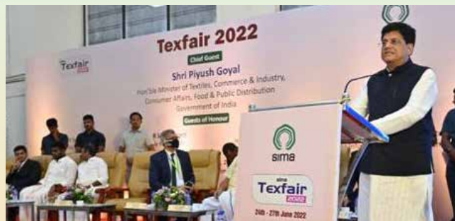
Hon'ble Union Minister of Textiles, Commerce & Industry, Shri Piyush Goyal addressing the gathering at the inauguration of SIMA Texfair 2022, an exhibition conducted by The Southern India Mills' Association (SIMA) at CODISSIA Trade Fair Complex, Coimbatore on 25th June, 2022.