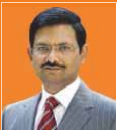
SHRI NITIN PATEL HON'BLE DEPUTY CHIEF MINISTER OF GUJARAT

There are a lot of opportunities in the Textile Sector as it is one of the highest employing sectors in India. Textile Sector is close to my heart. Government of Gujarat is making all efforts to make Gujarat as a major garment hub. If the garment sector receives a boost, there will be greater consumption, resulting in greater utilisation of Gujarat's cotton and man-made fibres, giving weaving sector a boost. Hence when the garment sector moves, it will take along the entire value chain from Farm to Fashion.